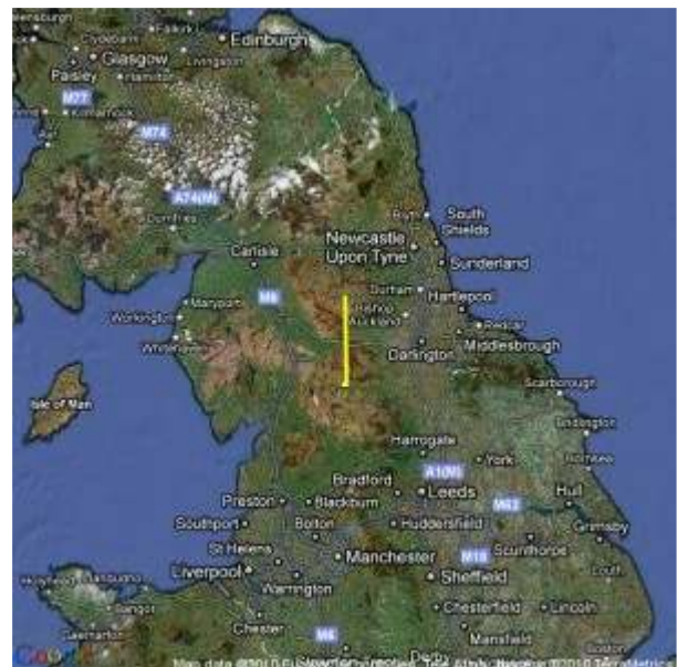
Flight Map for Saturday

On Saturday I also got a 49km flight in from Staggs Fell. This was great fun as I flew with a big gaggle of other pilots. Landed in Weardale.