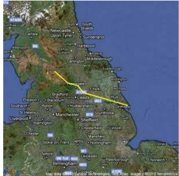
Flight Map for Thursday

I landed after 6hrs and 163km distance point to point. That is a personal best flight for me, and a new record distance for a paraglider flight from the Dales.