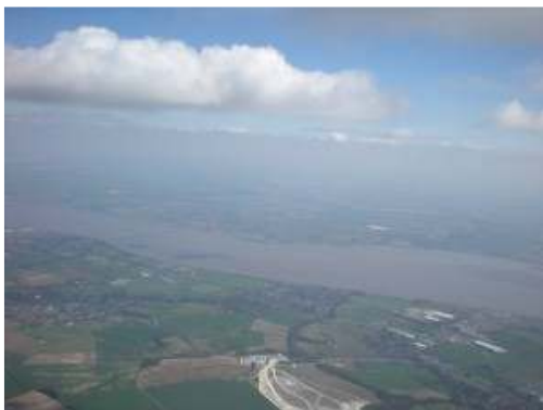
Toward The Humber Bridge

The next few hours saw me cross Harrogate, Wetherby, Tadcaster then South of York. Conditions were fantastic and I rarely got low. I had the pleasure of climbing up with sailplanes too.