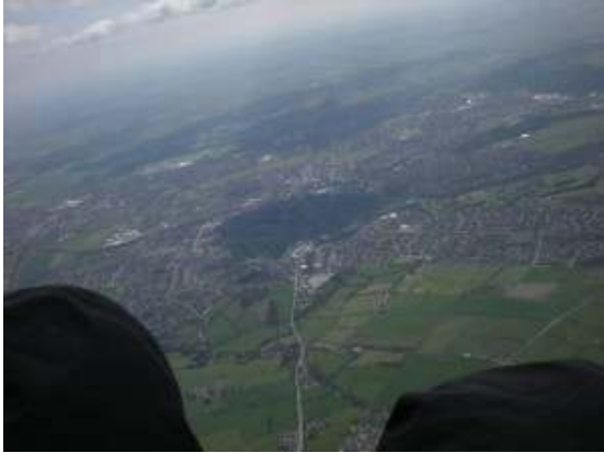
Looking down at harrogate

The next climb was a bit of a gamble, but I made it up again and spend the next 1hr slowly exiting the Dales. I got lowish at Patley Bridge then got a great climb from Greenhow quarry.