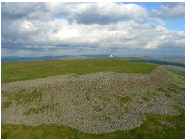
Cross Fell, Cumbria

The next round will be in June at one of the Pennine Soaring Club sites. It'll be a good opportunity to try a different type of flying and experience sites outside of the Dales. Get your names to Kev and give it a go.