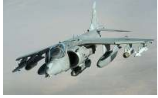
Harriers and Tornados often let down through cloud over Harrogate before

The Tucanos that you have seen are probably from RAF Linton on Ouse, and any Lynx helicopters are probably from Dishforth.