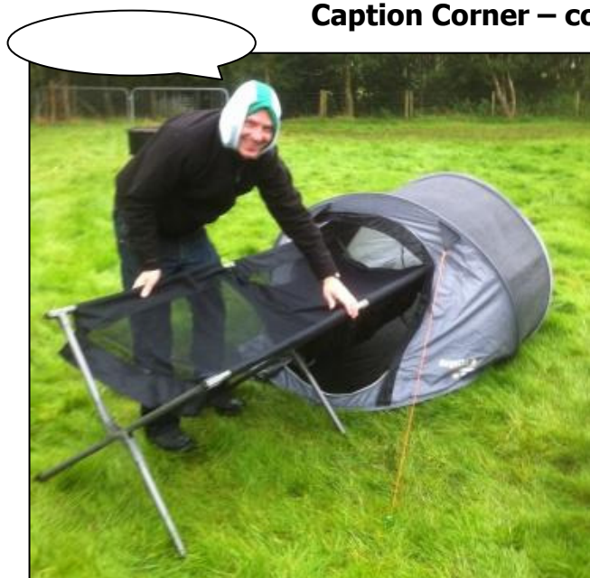
Jimmy at the Pennine Camping Classic / War of The Roses